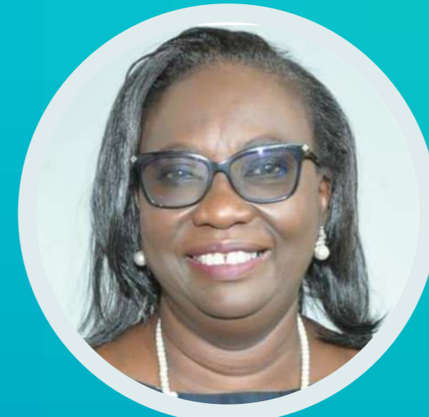
Hon. Dr. Aâssatou S. Gladima Minister of Petroleum & Energies, Republic of Senegal.