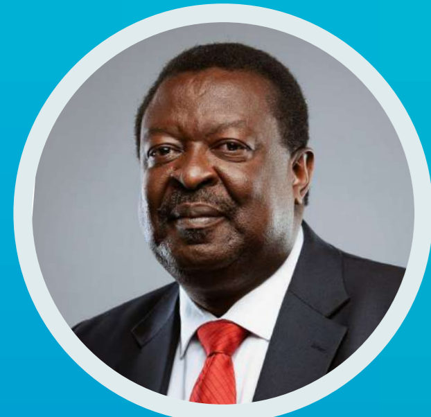
H.E. Hon Musalia Mudavadi Prime Cabinet Secretary, The Republic of Kenya.

3 rd - 4 th August 2023 Venue: Radisson Blu Hotel, Nairobi