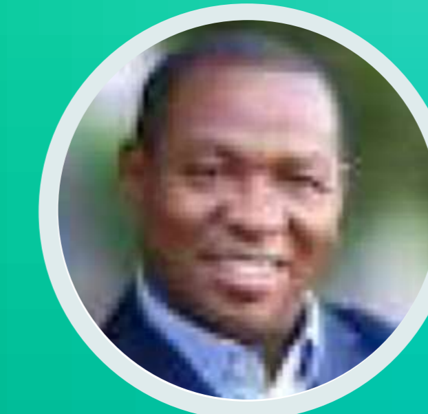
Hon Ndiritu Muriithi Former Governor, Laikipia County