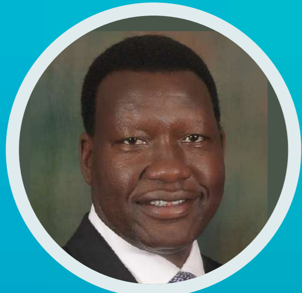
H.E. Hon Davis Chirchir Cabinet Secretary, Ministry of Energy & Petroleum, Republic of Kenya.